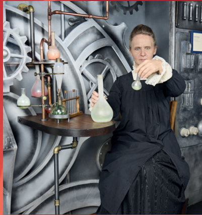
Marie Curie, 2 October 2025