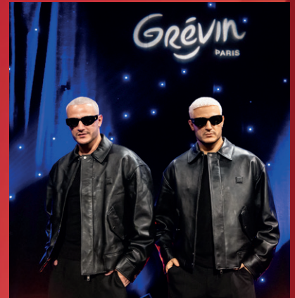
DJ Snake, 6 May 2025