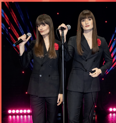
Clara Luciani, 4 February 2025