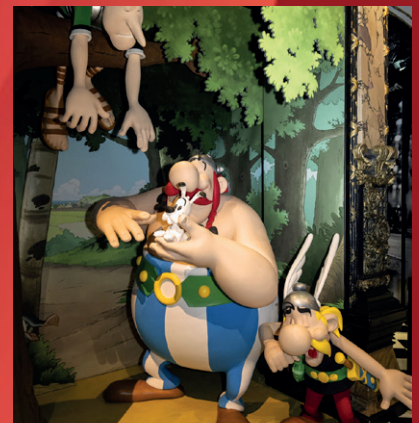
Astérix et Obélix, 22 October 2024