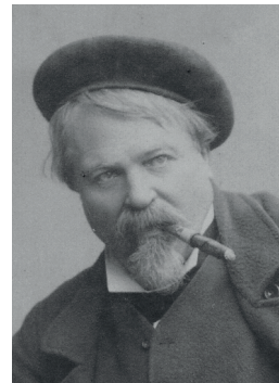
Alfred Grévin 1827 - 1892