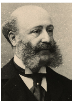
Arthur Meyer 1844 - 1924