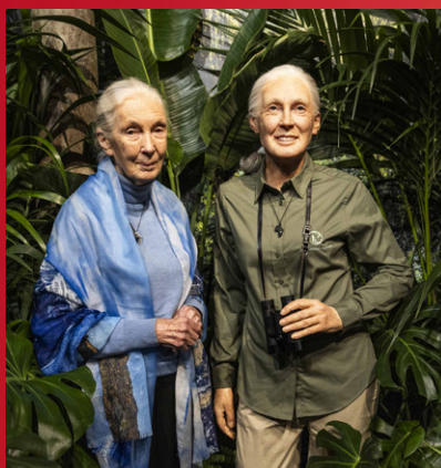
Jane Goodall, 1 st Décembre 2023