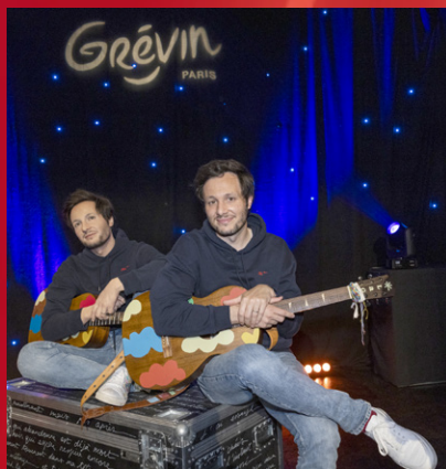
Vianney, 27 May 2025