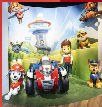
La Pat'Patrouille, 15 November 2023