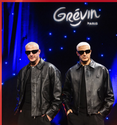
DJ Snake, 6 May 2025