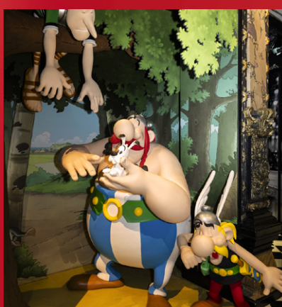
Astérix et Obélix, 22 October 2024